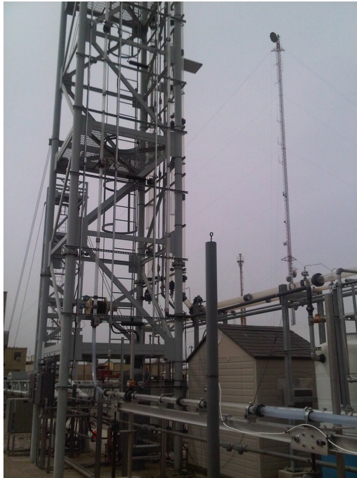
Figure 6. 2-in. Horizontal Well Experimental Facility

TU Horizontal Well and Artificial Lift Projects University of Tulsa 2450 East Marshall, Tulsa, Oklahoma 74110