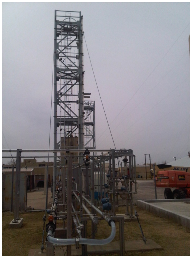
Figure 4. 2-in. Horizontal Well Experimental Facility