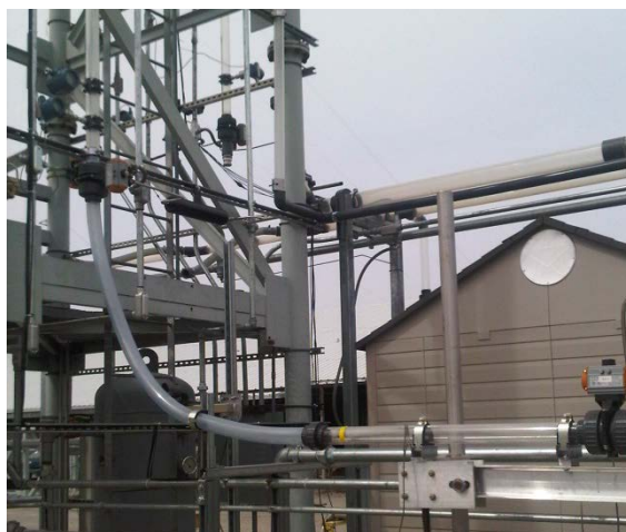
Figure 5. Curvature Section

TU Horizontal Well and Artificial Lift Projects University of Tulsa 2450 East Marshall, Tulsa, Oklahoma 74110