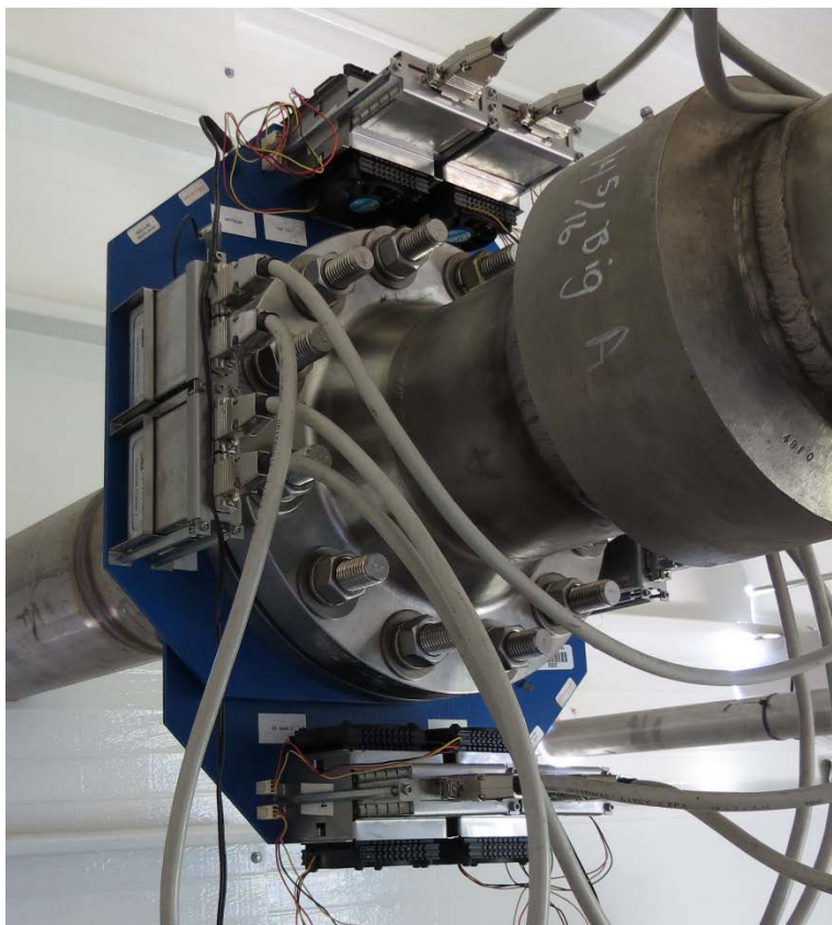
Figure 1. Dual WMS installed at 6-in. High Pressure Large-Diameter Pipeline Flow Loop.

TU Horizontal Well and Artificial Lift Projects University of Tulsa 2450 East Marshall, Tulsa, Oklahoma 74110